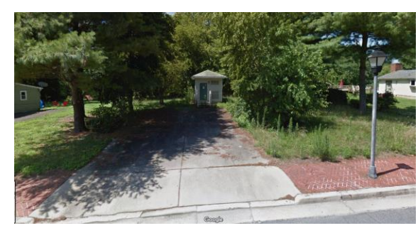
The Site of Cornelia's home before Gettysburg.